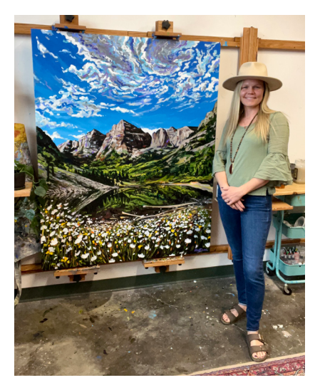
60X48" / 5X4' $8,640