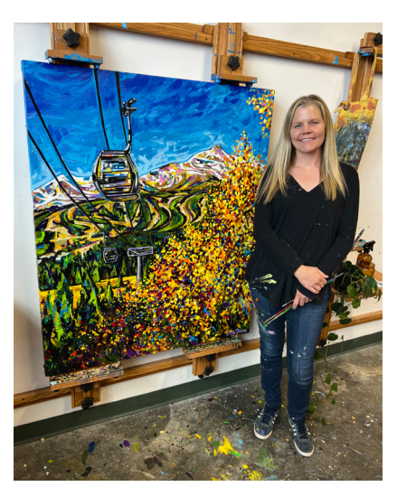
60X48" / 5X4' $8,640