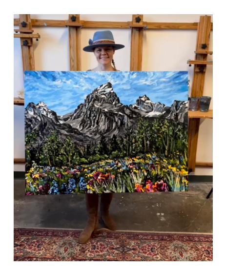
36X48" / 3X4' $5,184