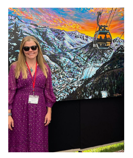
60X48" / 5X4' $8,640